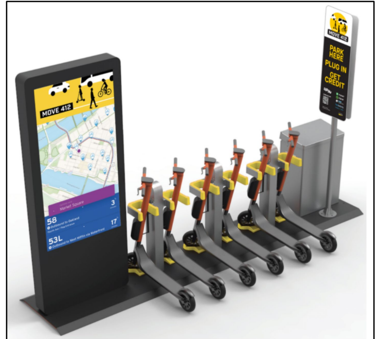
(Move 412 Mobility Hub)

Who? The City's Department of Mobility and Infrastructure and Spin, the micromobility unit of Ford Motor Company, have worked with numerous partners including Port Authority , Duquesne Light, and various neighborhood community groups to determine optimal locations for each hub.